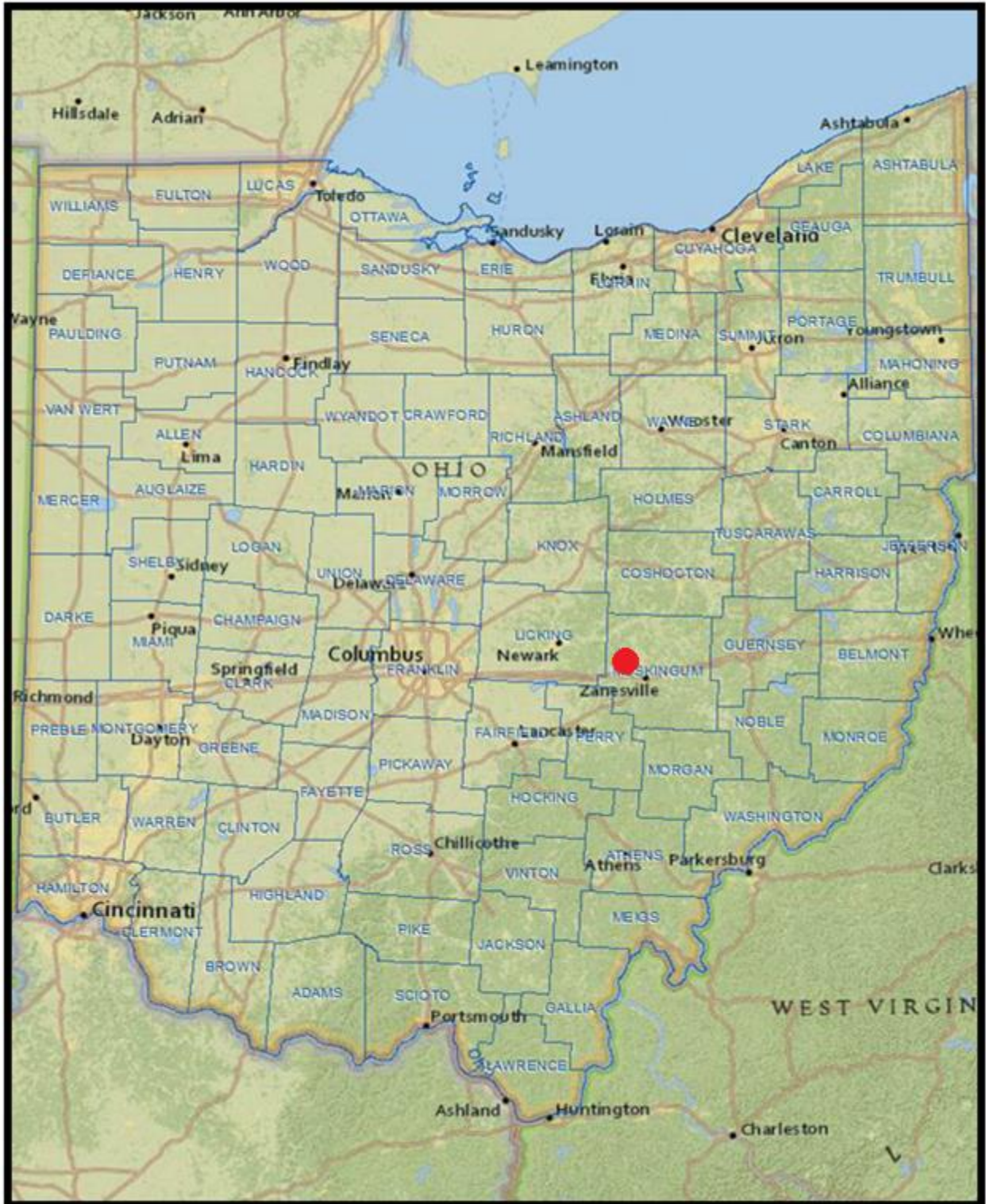
General project area (in red)